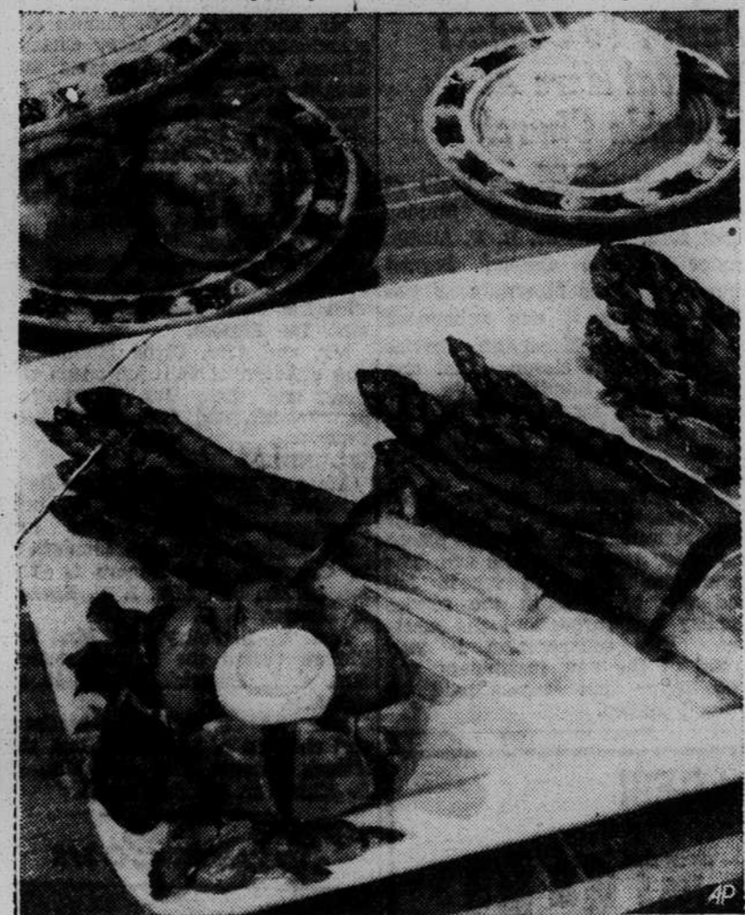
ASPARAGUS MARYLAND . . . Good spring eating.

1-2 teaspoon salt Wash asparagus and "peel" the ends of all waxy fiber. Tie into 3 or 4 bunches. Heat together butter or margarine, vinegar, sugar, boiling water and salt in a large kettle. Place asparagus flat in this liquid and cook uncovered until asparagus is tender. Remove and chill, saving the liquid. Measure the liquid when cold; add vinegar to make 3-4 cup. Add clove of garlic cut in half, 3 tablespoons salad oil, 1 tablespoon minced parsley and salt to taste. Stir. Remove garlic. Arrange chilled asparagus on large platter; remove strings from bundles and bind bundles with rings of green pepper. Garnish platter with tomatoes, hard-cooked eggs and watercress. Serve the sauce in a side dish. Chilled asparagus is also excellent served with a vinaigrette sauce.