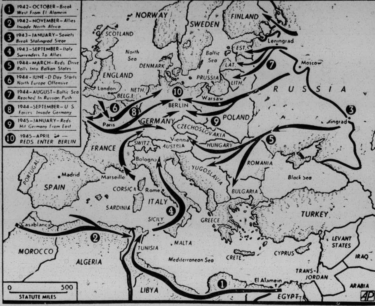
TEN HIGHLIGHTS ON THE ALLIES' ROAD TO BERLIN—Major geographical highlights in World War II, since the Allies turned the Nazi tide at El Alamein and Stalingrad, are traced on this map showing the general trends of Allied thrusts during the last two and one-half years, climaxed as Russian forces reached Berlin and U. S. and Russian troops neared a junction south of Berlin.