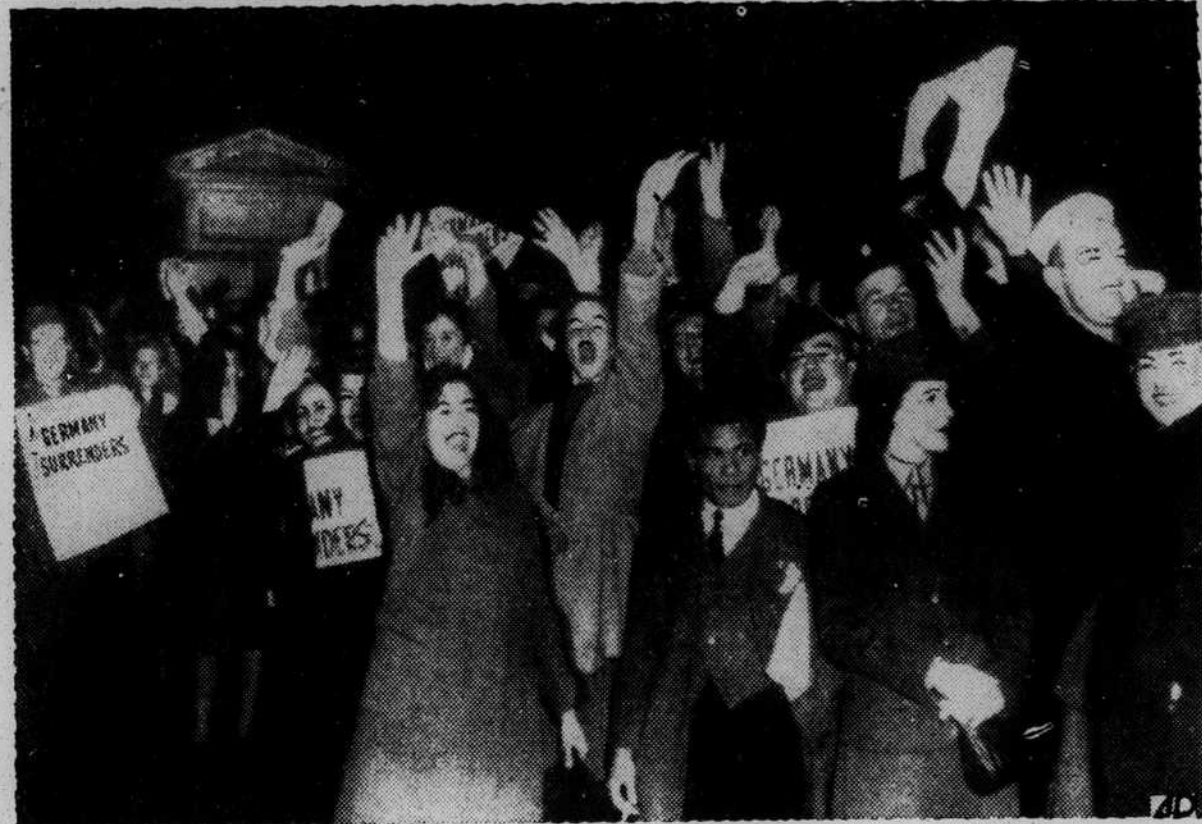
CROWD AT WHITE HOUSE CHEERS SURRENDER REPORT—A crowd before a gate at the White House in Washington cheers in celebration of report of Germany's surrender, holding up black headlined newspapers.