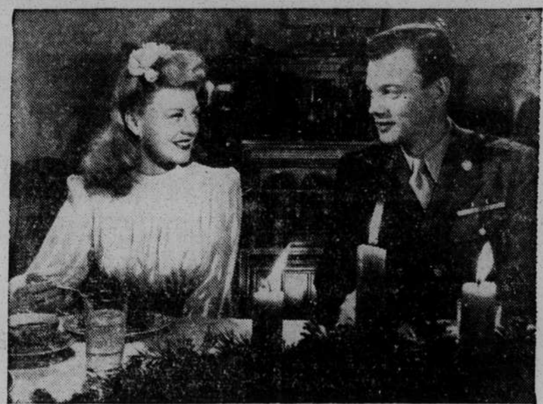
HELD OVER! —Christmas dinner with a pleasant, happy family, helps restore Zachary Morgan's (Joseph Cotten) confidence in himself and his future. Above are Ginger and Mr. Cotten in one of the lighter moments. "I'll Be Seeing You," the Selznick International film held over at the Rogers Theatre. Shirley Temple is also starred in this production, which was directed by William Dieterle for Dore Schary.

ONE 8 PIECE DINING room suite. M & M Salvage Co., Rear Piggly-Wiggly. 1t-10c