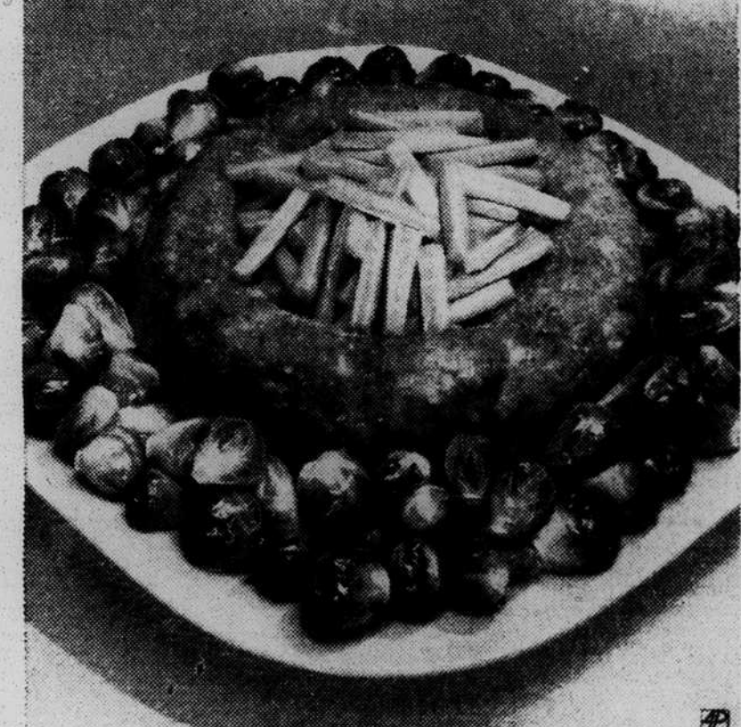
TOASTY FISH RING . . . Good enough for company dinner . . .

who are authoritative speakers on the various subjects pertaining to distribution; they take part in varied other activities which promote the good of their work, school and community. Foremost among activities is the annual dinner planned for by the student clubs and given in honor of their bosses who have made it possible to use business an educational laboratory. The Distributors Clubs, promoted by the Federal Office of Distributive Education have been organized on a nationwide basis beginning with the local clubs. These in turn are organized into a state organization from which delegates are sent to a federal conference.