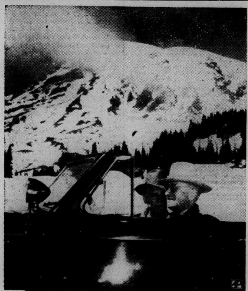
TRUMAN ENJOYS MT. RANIER—President Truman (at wheel) stopped his car to enjoy this striking view of Mt. Ranier. Seated in the car with President Truman is Governor Mon Wallgren who accompanied the President on his recent trip.