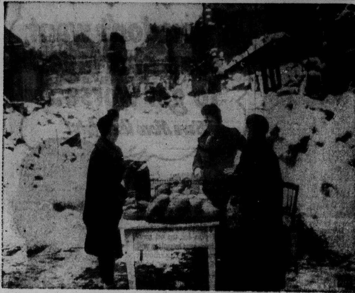
NUERNBERG WOMEN SHOP IN SNOW—A German woman sells loaves of bread off a table amid snow-covered ruins of blitzed buildings in Nuernberg, Germany, where the war crimes trial is in session. Picture was made Nov. 26, the day of the first snowfall of winter. (AP Wirephoto).