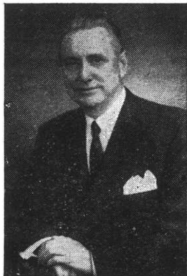
Senator Willis Smith

Radio reports this morning announced the death of Senator Willis Smith of North Carolina at the Naval Hospital at Bethesda, Md., where he was taken following a heart attack Tuesday.