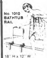
No. 1010 BATH TUB RAIL 18" H x 12" W