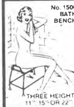
No. 1500 BATH BENCH THREE HEIGHTS 11" 15" OR 22" H