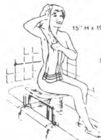
No. 50 BATH BENCH 15" H x 19" W x 11" D No. 620 BATH TUB RAIL 7" H x 18" W