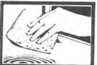
Easy to clean one-piece up-swept cooktop.