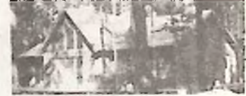
WOODSY MANOR: 3 bedroom, 2 bath, new cedar home w/cathedral ceiling, wrap-around deck set on 7 plus acres in new horse area. $98,500.