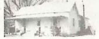
COUNTRY DANDY: Gowensville with super mt. views, 3 BR, great room, fireplace, low down payment, 10% broker/owner financing. $69,900.