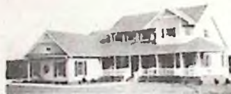
SHOWPLACE: Executive 2700' 3 BR, 2.5 BA at Earl's Fort; full dining and living rms., den, etc.; heart o' pine floors, open stair, antique windows, mantel, gazebo porch, lake view deck, 2.21 acres. $295,000.