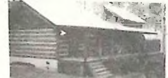
HUNT COUNTRY LOG: Total splendor in prestige location, 2 BR, 2 BA with sprawling porches, gigantic living room, saunb w/ whirlpool and solar room. $198,000.