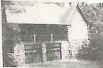
EXECUTIVE LOG HOME, 4 BR, 2 BA, nestled in 7.9 gorgeous, wooded acres, full basement, 2 porches, 2 car garage, blue collar priced at $109,500.