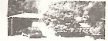
CITY SLICKER: walking distance from Bi-Lo, 3 BR, 2 BA, large kitchen, fenced yard, front deck with ramp, central air. $34,900. $39,900.