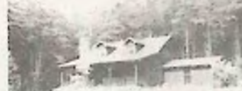
GOWENSVILLE RANCHETTE: Glorious 7 acre showplace of pastures, woods and mt. views. Newer 3 BR, 2 BA cedar cape cod, fireplace, wrap around deck. $99,500.