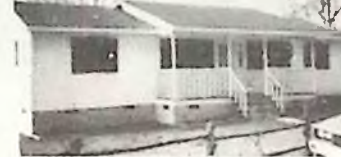
NEW 4 BEDROOM! A year old and ready for growing family, 2 BA and 24' swim pool, close to shopping, church and school. $69,900.