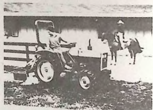
M-F 1020 with M-F 1028 Box Scraper