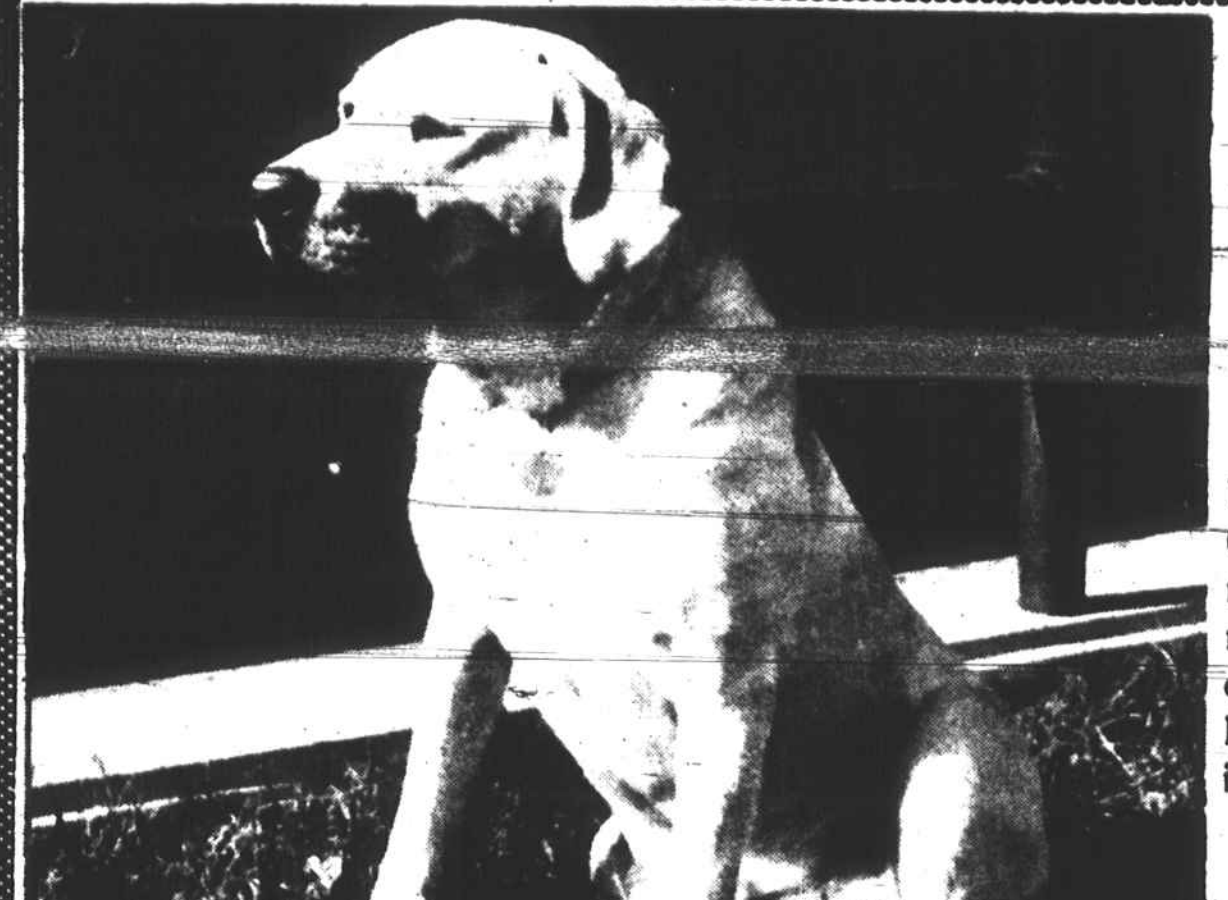
Chase is Winston-Salem's first narcetics dog.