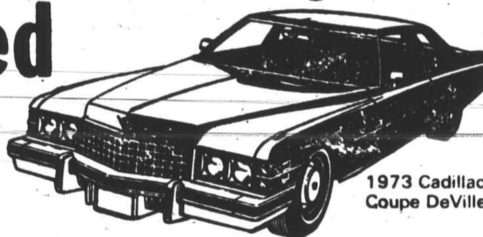
1973 Cadillac Coupe DeVille