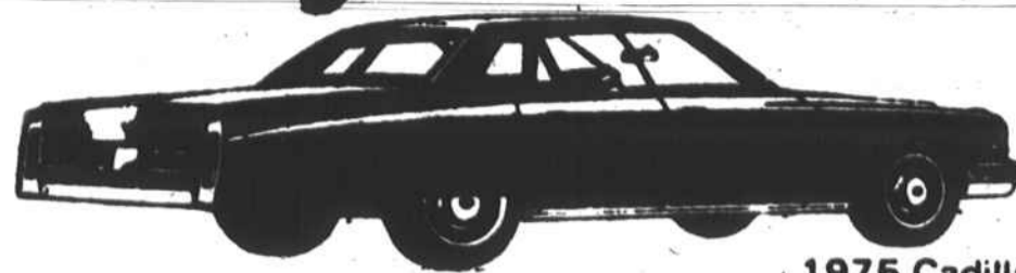
1975 Cadillac Sedan DeVille