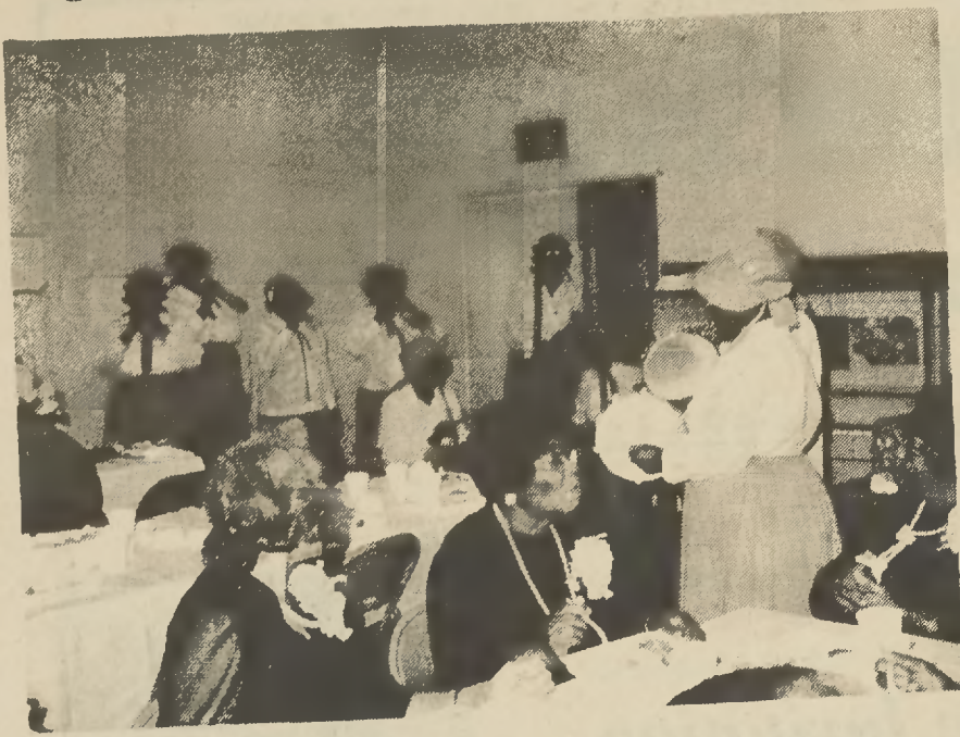
Senior Citizens Rhythm Band performs for clubs first anniversary