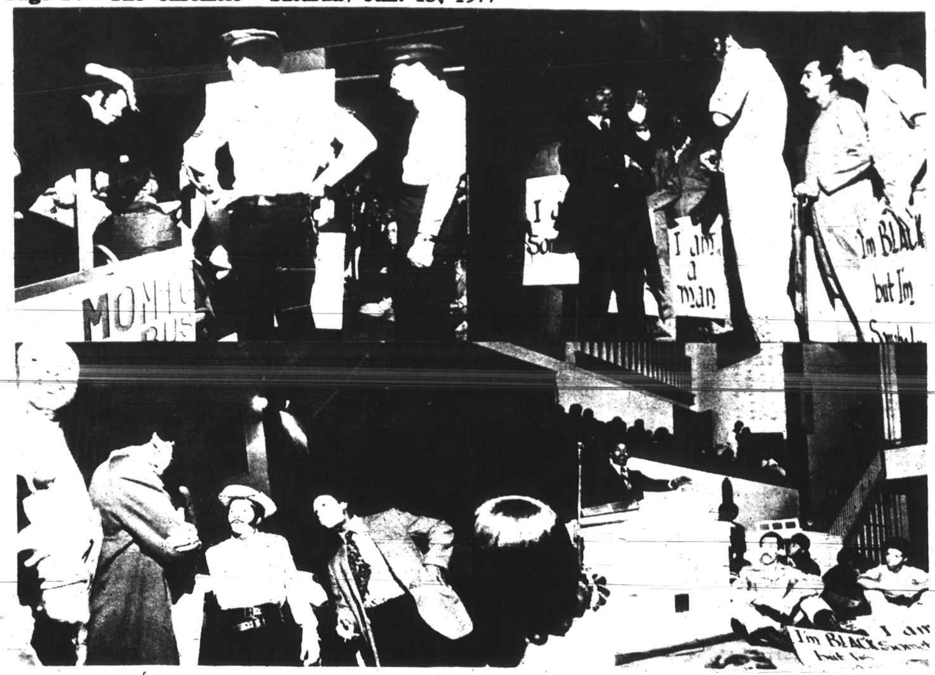
Scenes From Life Of A King