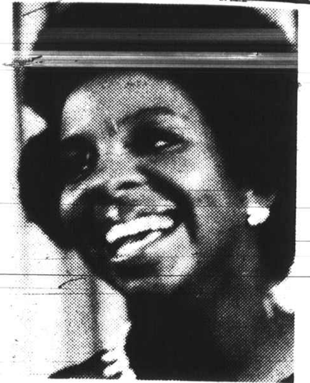
PD-13 Songstress Gladys Knight makes her motion picture debut in "Pipe Dreams," an Avco Embassy release opening Now at the Winston Theatre . The romantic adventure set against the building of the Alaska oil pipeline co-stars Barry Hankerson.

"As Maria, Gladys is warm sympathetic, wonderfully good-humored and able to endure all kinds of hardship without com-