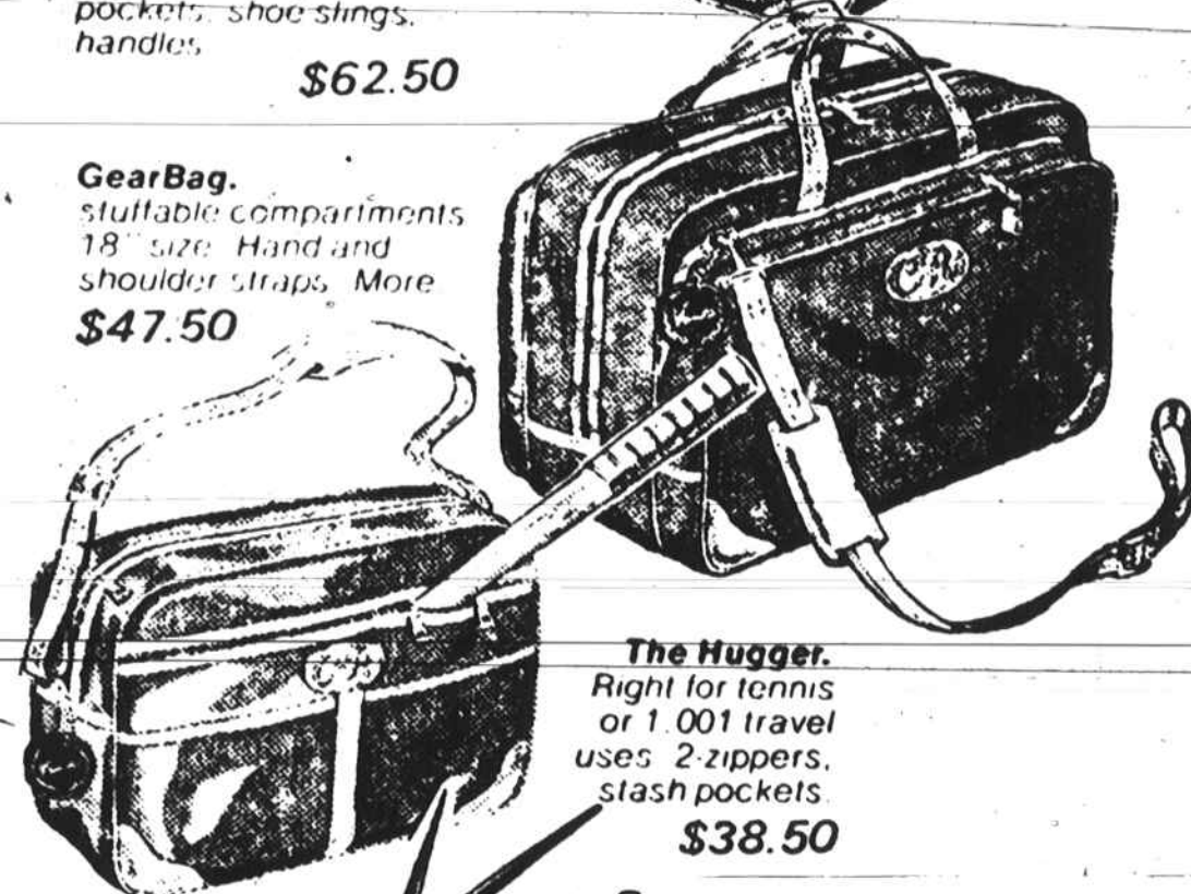
GearBag. stuffer compartments 18" size. Hand and shoulder straps. More. $47.50