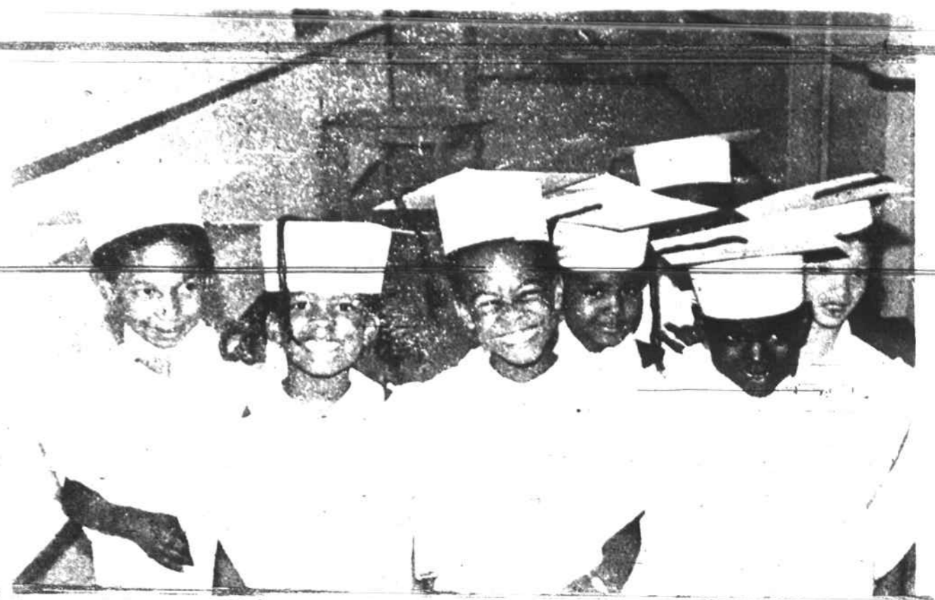
The Little Goler Grads, of Goler Child Development Center, smile happily after receiving their graduation certificates.