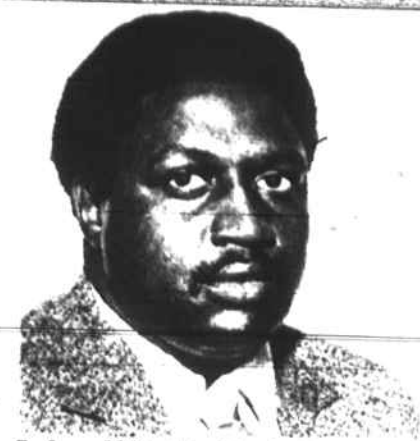
John [Night Train] Lane