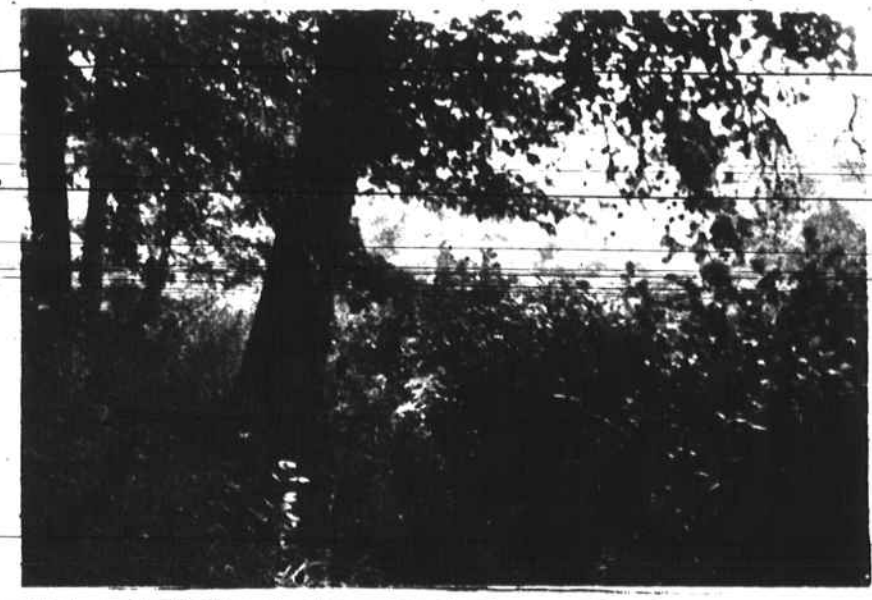
A jungle? No-just neglected growth closing in on paths and picnic areas at Winston Lake.

Maybe if preventive measures had been exercised, the Winston Lake pool would have been open this summer. Hairline cracks in masonary will take water and the freezing of some will damage bottoms of pools. Masonary has to be maintained to prevent this occurance. At this point I would like to invite the Parks and Recreation Commission to make a tour of these dying