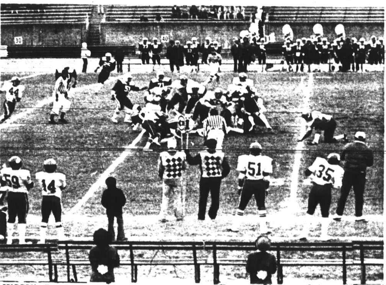
WSSU's Rams capped an undefeated season with last Saturday's final victory, a triumph over Shaw University.