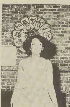
"Soft and Feminine"