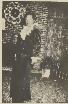
"Elegant and Evening"