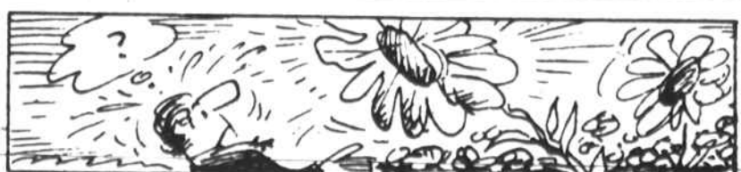
Jerusalem artichokes are really sunflowers that can grow six feet tall. They grow from tubers that are delicious and starch-free, raw or cooked.

Goods, a new basketball is being developed especially for the women, a basketball that will be smaller in size and lighter in weight, also opening up a new market. On the television end, the WBL is nearing completion of a super syndicated television package for the first season, and we expect to have final plans soon.