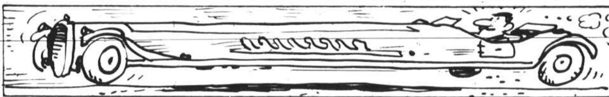
The largest car ever built was the Bugatti "Royale" of which only six were made. It measured over 22 feet in length and the hood alone was over 7 feet!

browner, have also developed a new line of special microwave cooking utensils. The new shapes and sizes of these dishes help microwave oven owners get the most out of their equipment, yet this glass and glass-ceramic cookware can also be used in conventional cooking and for serving and storage too. With aids like these, you can get a lot of good meals out of a microwave with very little effort.