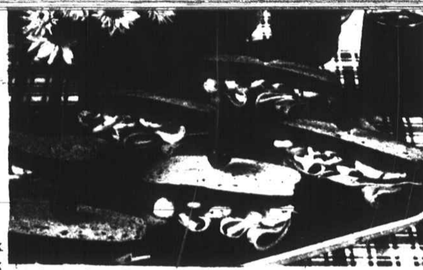
A trio of ready-to-serve meats team up with potato salad for super summer sandwiches.

In the microwave oven, follow directions above except close bag with rubber band, string or ½-inch strip cut from open end of bag. Micro-cook on high power setting, 8 to 10 minutes, turning dish once.