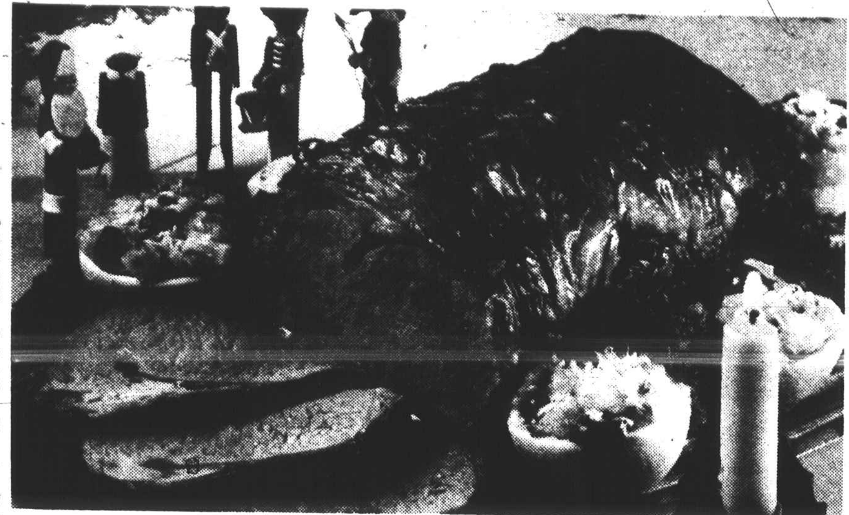
Beef Ribeye Roast

for it is boneless and can gisters about 5 degrees F. easily be carved into uni- below desired degree of doneness, remove roast Place a 4 to 6-pound beef from oven and allow to rib eye roast, fat side up, on "set" 15 minutes before