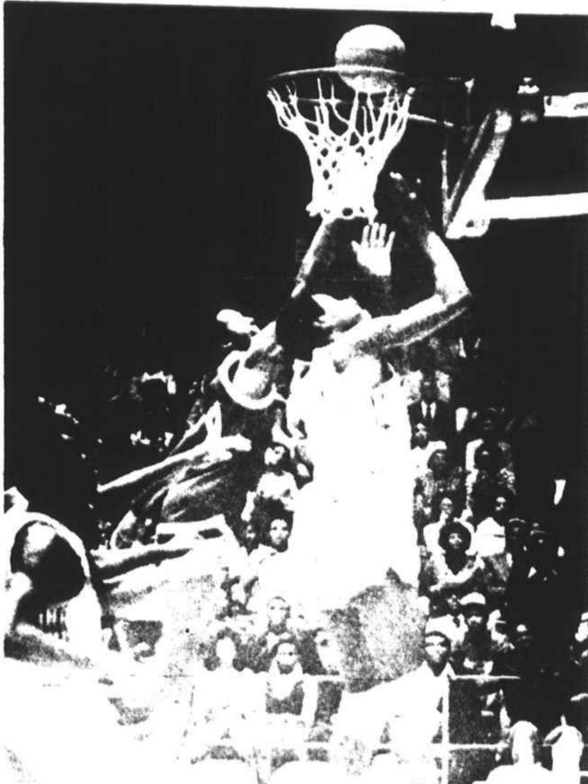
Winston-Salem State's Rams will try to start the year off with a win Saturday night. The Rams are 2-6 on the season.