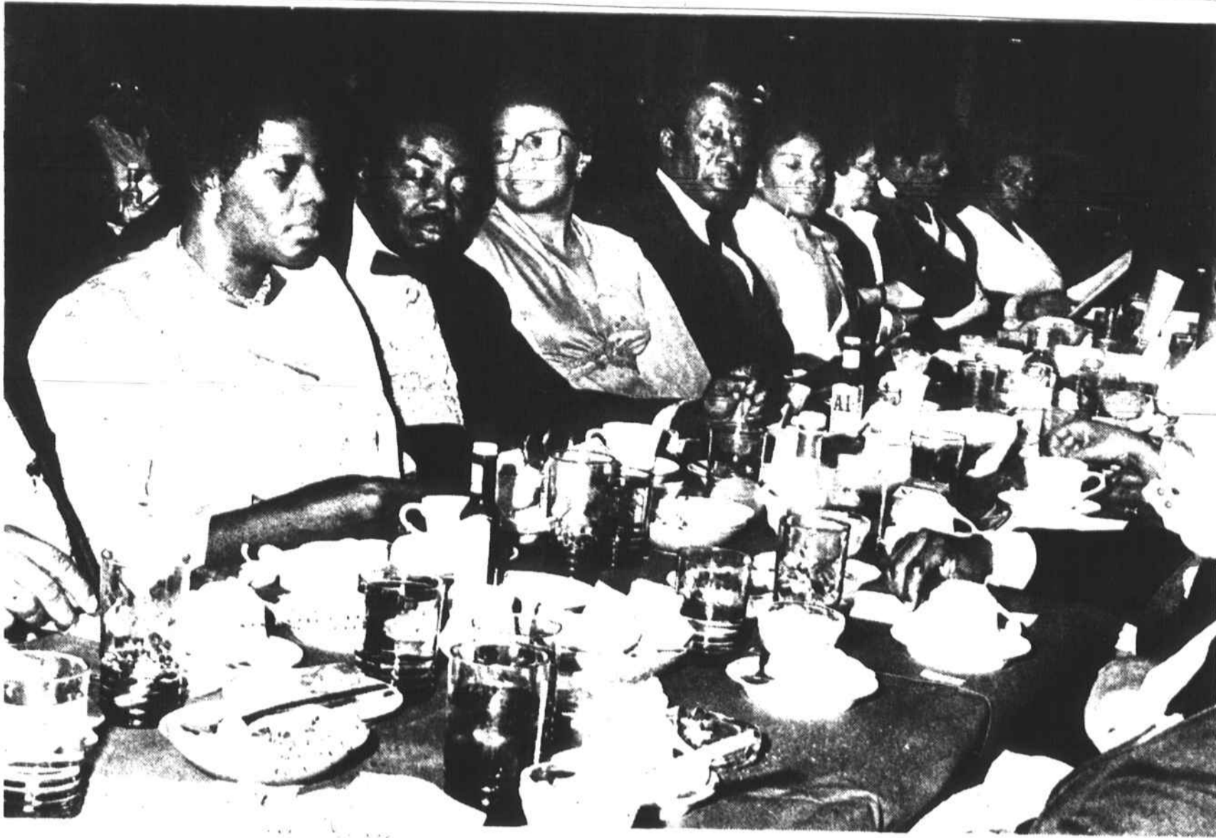
Members of the Phalanx Fraternity and their wives at the organization's banquet.

Music for the dance was provided by the Astrology Band