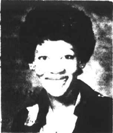
Assembly woman Maxine Waters

New York, N.Y.--Edward Lewis, chairman of the board of ESSENCE Communications, Inc. (ECI), announced today the appointment of California State Assemblywoman Maxine Waters to the corporation's board of directors.