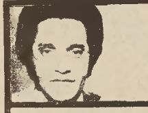
TONY BROWN'S JOURNAL

"Do you believe that you were used? That your deep devotion for the Honorable Elijah Muhammad was used to manipulate you?" I asked. "It's possible. At the time, you know, no one could convince me that was the case, but I realize now that it's possible. It's very possible that I could have been a pawn. It's very possible that someone just knew I was a good candidate to, you know, do this,