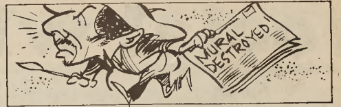
A mural done by the great Mexican painter Diego Rivera for Rockefeller Center was destroyed by order of its sponsors because Rivera included a portrait of Lenin. The mural was reproduced in Mexico City at the Palace of Fine Arts.

Tony Brown's Journal, the television series, is shown every Sunday, on WGHP-TV, Channel 8 at 11:30 p.m.