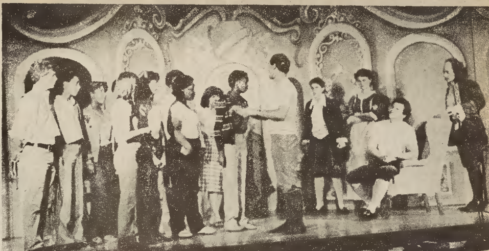
The National Opera Company of Raleigh performs "The Marriage of Figaro" before junior high school students in the Winston-Salem/Forsyth County school system.