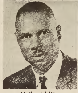
Nathaniel King Church in Walnut Cove. The public is cordially invited.