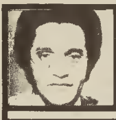
TONY BROWN'S JOURNAL

The composite rendering was true to Cosby's verbal directions. She added that he was chubby and had a "G"