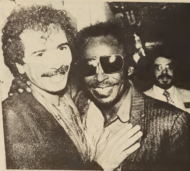
The Man With The Guitar And The Man With The Horn: Columbia recording group Santana climaxed a series of New York City area concerts with a special one night stand at the Savoy in Manhattan -- there first club appearance here since October 1978. In attendance for the night was a long-time Santana admirer, Miles Davis (whose new Columbia album is forthcoming this summer)-- the admiration was mutual, of course, as Devadip Carlos Santana and the band were heard quoting liberally from the Miles 'book.'

I was flat on my back and couldn't get up. When I needed a drink, I couldn't hold the cup. But all that's changed; for now I'm well. Thank you for giving me this story to tell.