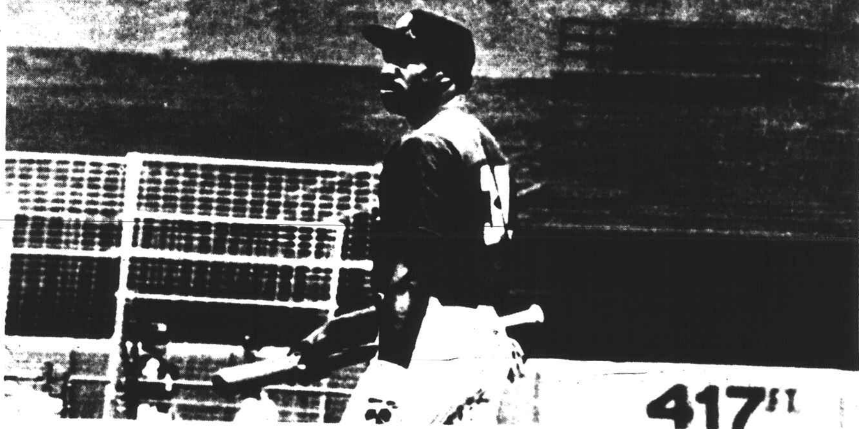
New York: Multi-bucks Dave Winfield of the Yankees is welcomed back to Yankee Stadium 7/31 for workout after the settlement of the baseball strike.