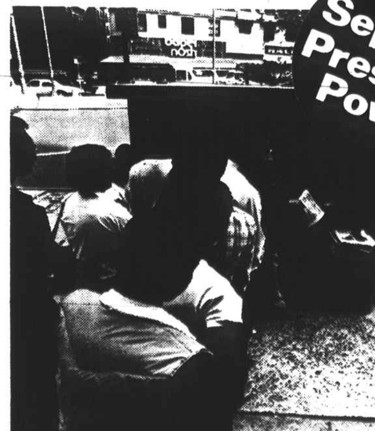
Millions of Black men and women buying only Black newspapers, September 17, 1981.

AND STEVEN, FULL OF FAITH AND POWER, DID GREAT WONDERS AND MIRACLES AMONG THE PEOPLE.