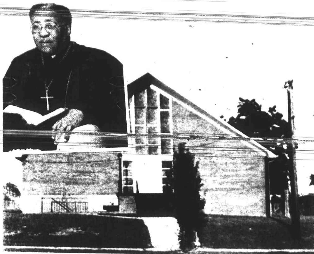
St. Peter's Church Of God Apostolic, located on the corner of Highland Ave. is Church of the week.