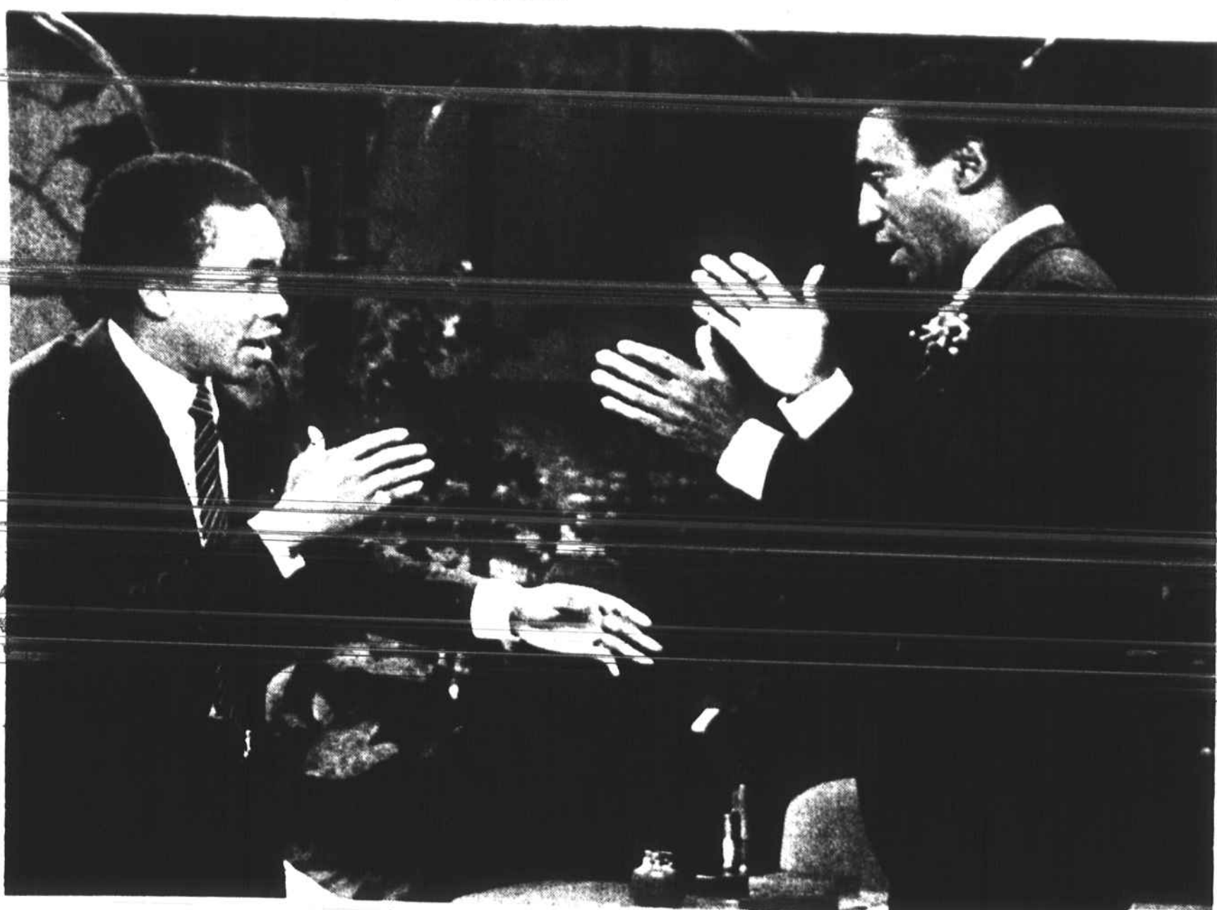
Hollywood: WBC Welterweight Champion Sugar Ray Leonard (L) shows a little quick hand movement to guest host Bill Cosby during last night's showing of "The Tonight Show" 8/24. While giving lessons in throwing punches, Leonard talked with Cosby about his upcoming championship fight on 9/16 with Tommy Hearns in Las Vegas.