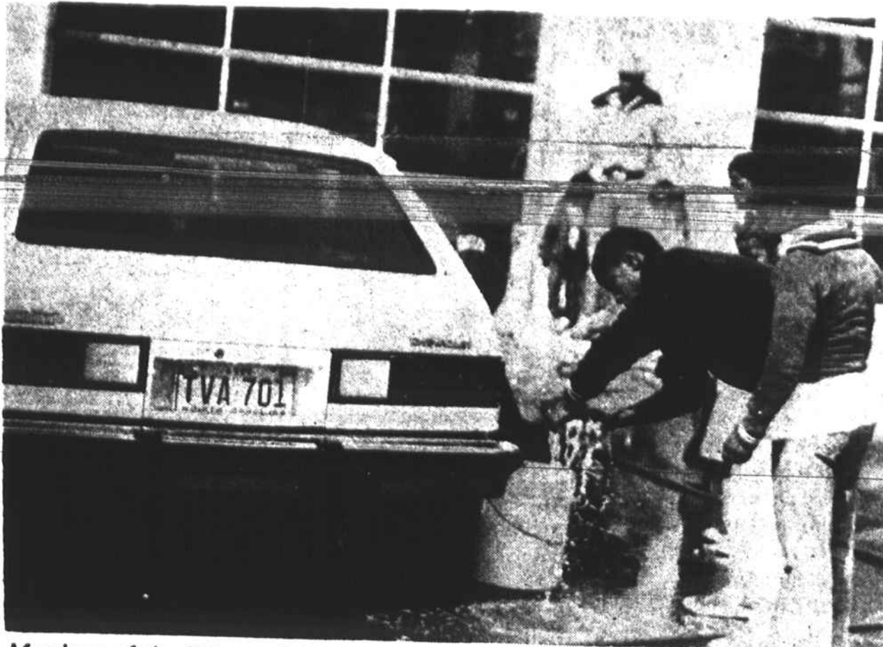
Members of the Winston-Salem Performers wash cars to raise funds to support their drill team.