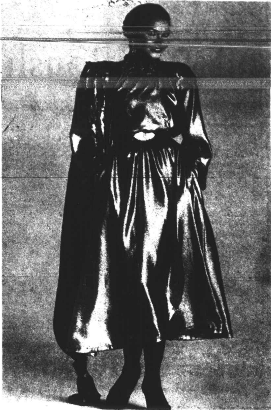
All that glitters is big fashion news and Louis Feraud beaded a copper tone cocktail dress to add sparkling highlights to the burgundy ostrich feather trim.