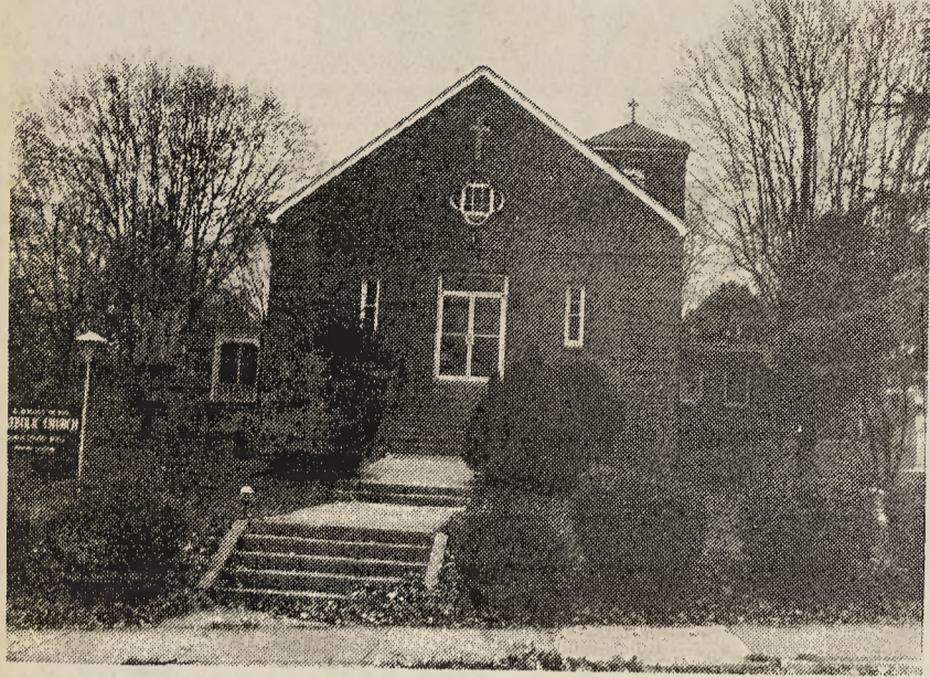
[CHURCH OF THE WEEK] St. Benedict the Moor Catholic Church

"Come and get your spiritual strength renewed."