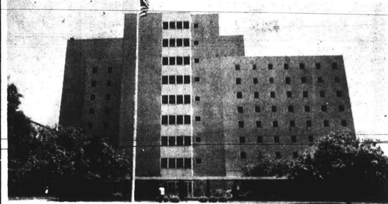
As we grow we're growing better...for you

Forsyth Memorial Hospital requests the survey by the Joint Commission and pays for the service. This request signifies a professionally motivated, voluntary commitment to self-improvement. Every service to the hospital, from the governing body to the physical plant, is reviewed for compliance with the Joint Commission's standards.