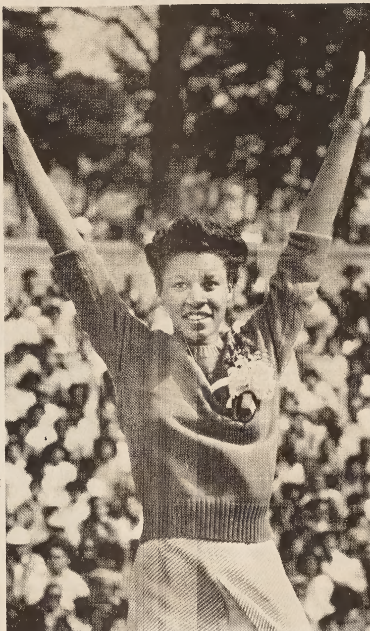
"V" for victory is the signal this Winston-Salem State cheerleader is giving after last week's homecoming game against J.C. Smith.