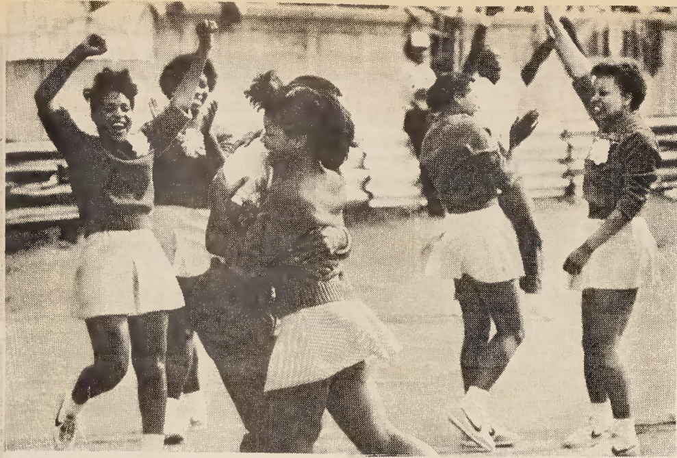
Winning any game is sweet, but winning the homecoming game is the ultimate taste of victory as these Winston-Salem State University cheerleaders prove after the Rams' 33-17 win over Johnson C. Smith last weekend.