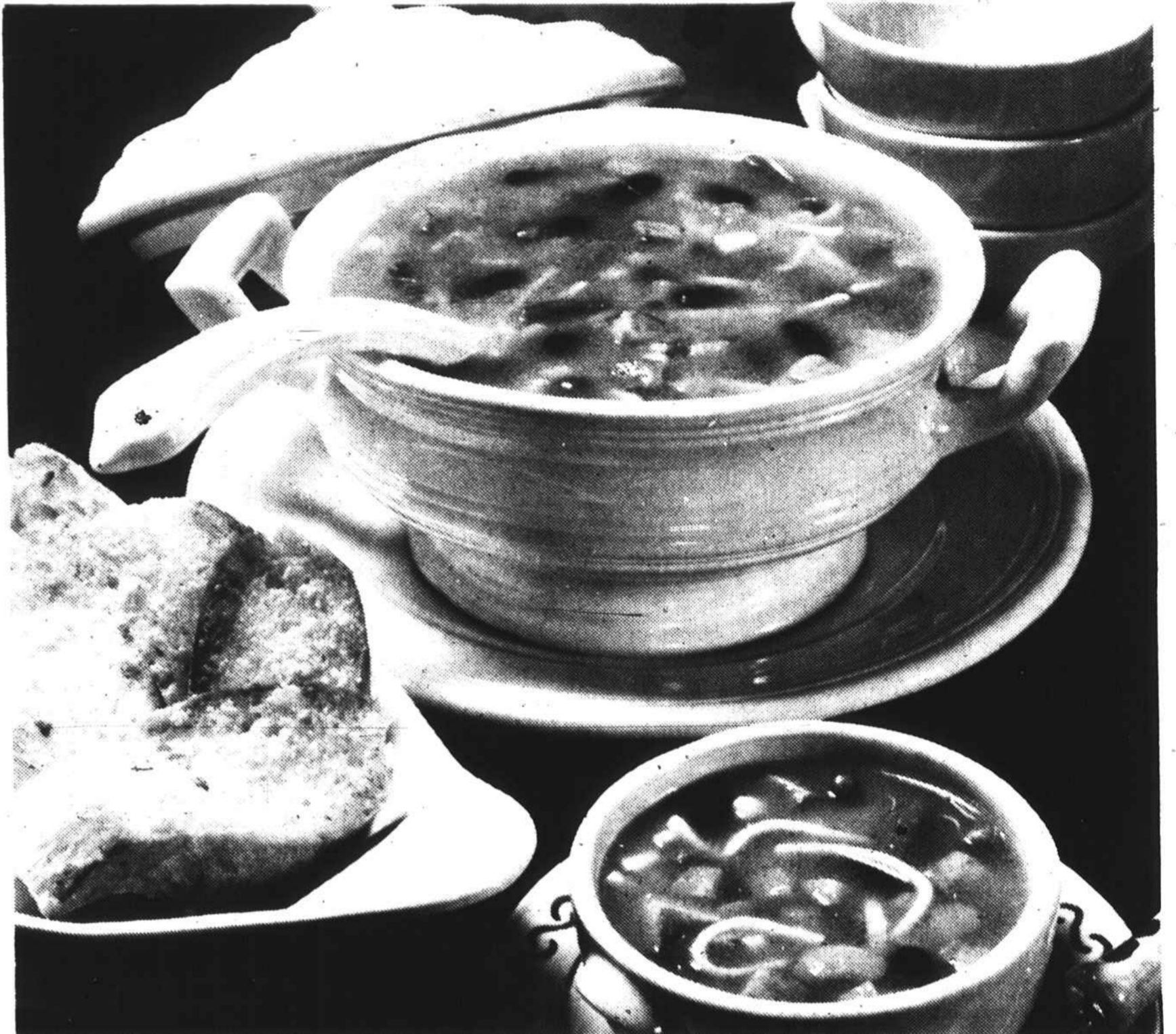
A Balanced and hearty meal for the home team to enjoy while watching television football, features Country Style Ham and Bean Soup.