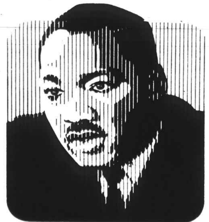
Rev. Martin L. King

We salute Dr. King, a true patriot and indomitable champion of human rights, on the occasion of his Birthday celebration.