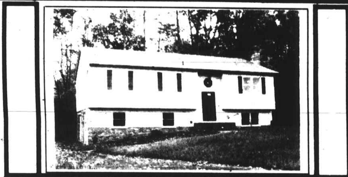
Call For Details

3 - New Homes available in Shalimar. 10.35% fixed rate for 30 years. N.C. State Housing Money.