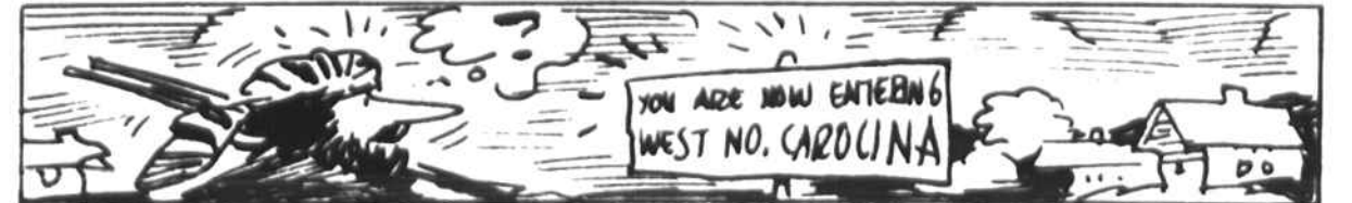
Prior to 1790, Tennessee was just the western section of North Carolina, then ceded to the federal government.