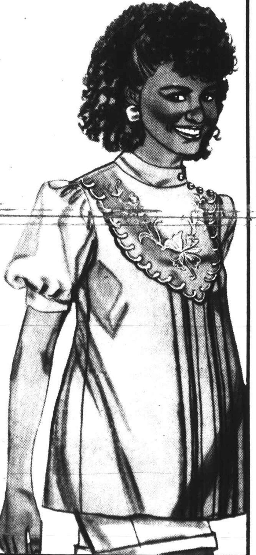
Hanes Mail: 768-9200 Shop Monday to Saturday 10 to 9:30; Sunday 1 to 6