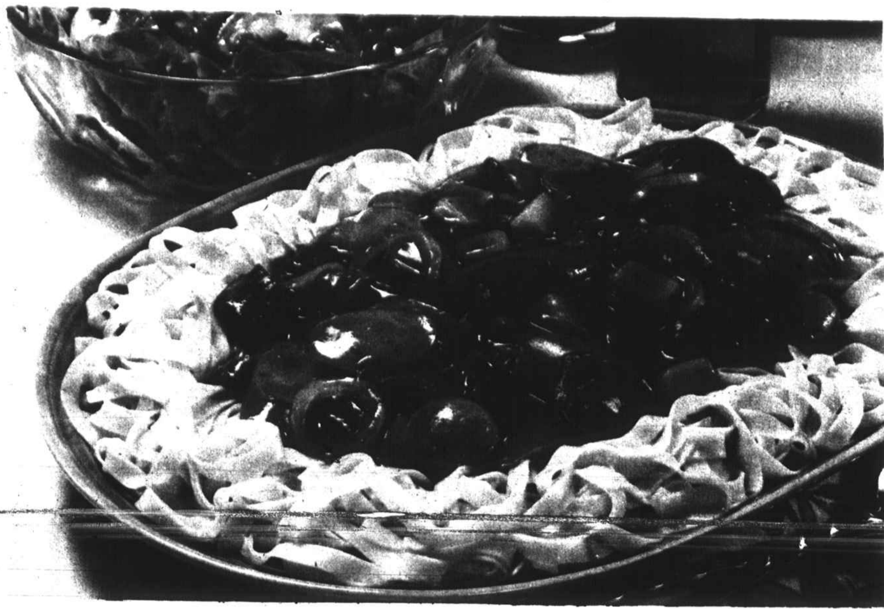
Crunchy Bean Salad and Beef and Beer Stew with Noodles are part of a fast-to-fix 45 minute meal.