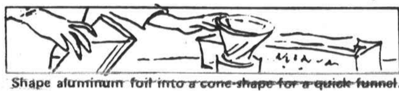
Shape aluminum foil into a cone shape for a quick funnel.

There ain't nothing that will completely cure laziness, but I hav known a second wife tew hury it sum.