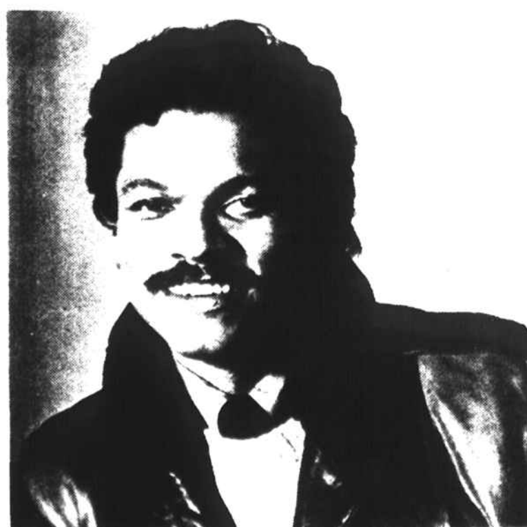
Billy Dee Williams