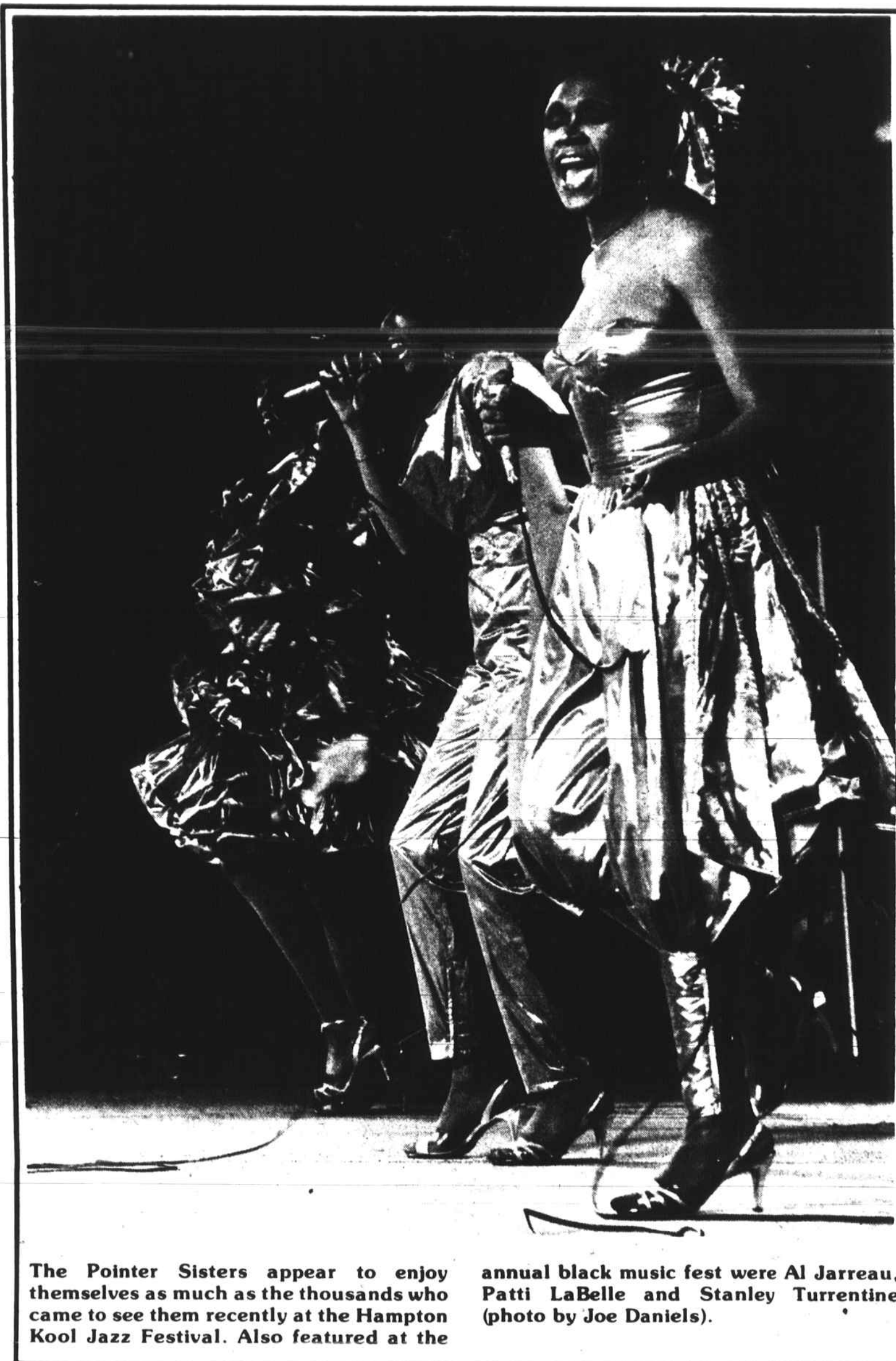
The Pointer Sisters appear to enjoy themselves as much as the thousands who came to see them recently at the Hampton Kool Jazz Festival. Also featured at the annual black music fest were Al Jarreau, Patti LaBelle and Stanley Turrentine.